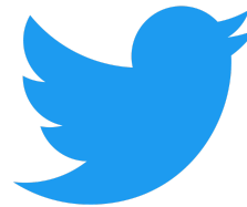
Twitter Australia and New Zealand