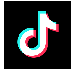
Tik Tok Australia and New Zealand